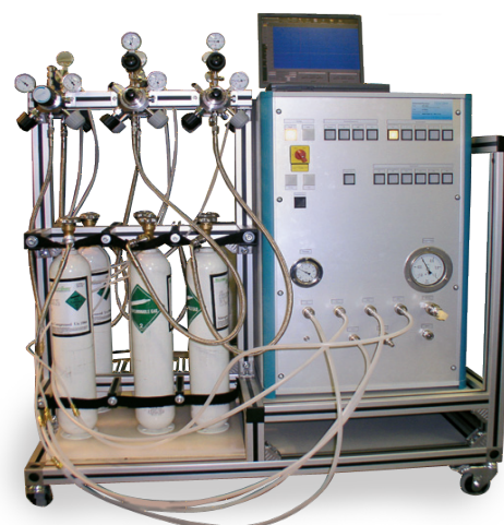
Automotive R&D, Instrumentation