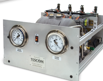
Aerospace Instrumentation, R&D